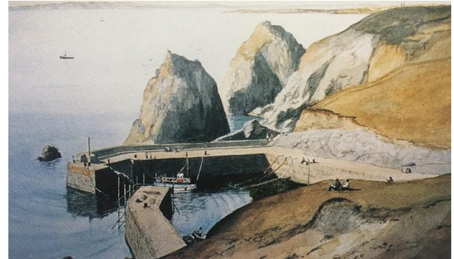
5. 'Mullion Cove, Cornwall' by David Addey. Watercolour. 1988. Private Collection