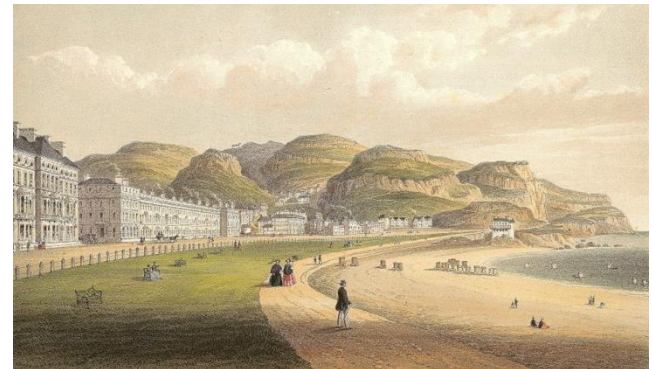
7. 'Llandudno' mid-19thc lithograph. Private Collection