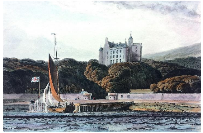
4. 'Dunrobin Castle, Sutherland' by William Daniell RA. 1820. Aquatint.

For further details and future newsletters visit www.coastalandgeotechnicalservices.com .