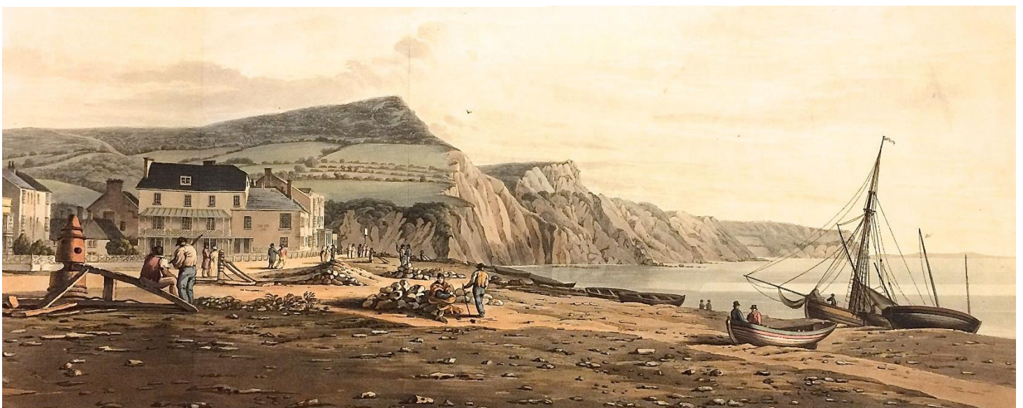
3. 'Sidmouth, Devon' (detail) by Hubert Cornish. Coloured Engraving. c.1815. Private Collection