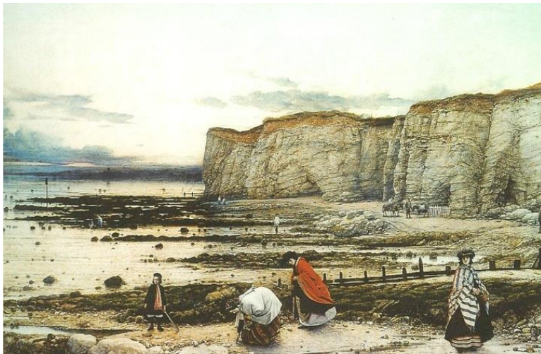
6. 'Pegwell Bay, Kent' by William Dyce RA. 1858-60. Oil.